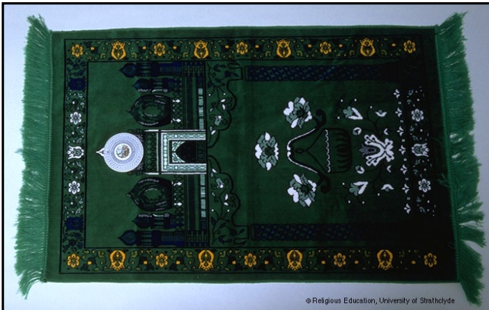
© Religious Education, University of Strathclyde