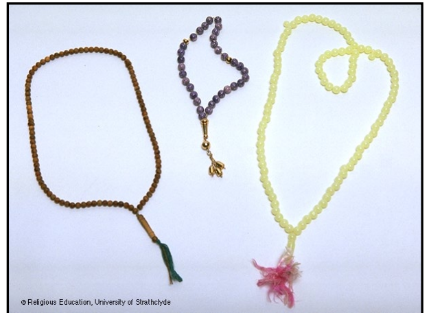
© Religious Education, University of Strathclyde